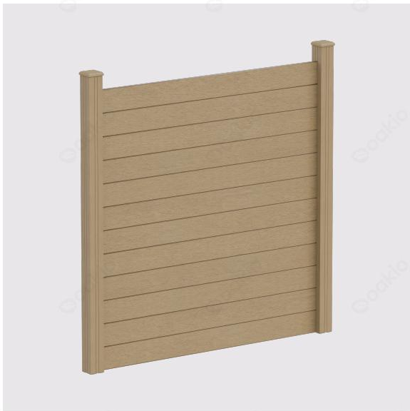
Iniwood fencing with WPC post