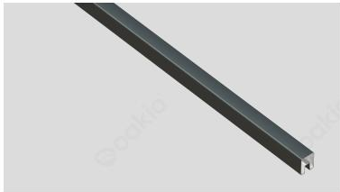
Aluminum Top Rail