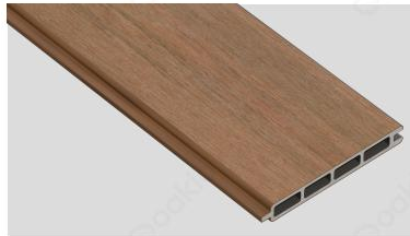
WPC Fence Board

Code: FAB01 Dimension: 47.5 x 21.7 x 6mm