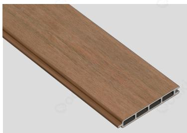
WPC Fence Board

Code: PFS-TB Dimension: 150 x 20 x 1730mm