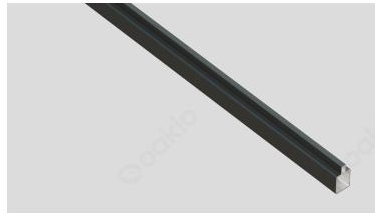
Aluminum Bottom Rail