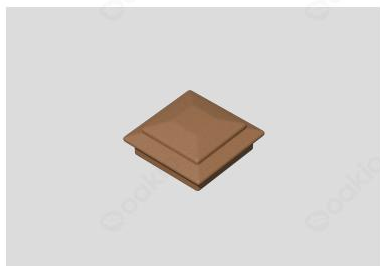
Plastic Post Cap

Code: PFS-PC Dimension: 100 x 100 x 30 mm