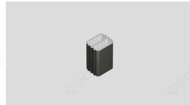
Aluminum base supporter

Code: FAR01 Dimension: 21.8 x 31 x 17.6mm