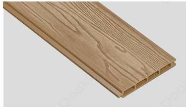
WPC Fence Board

Code: FAB01 Dimension: 47.5 x 21.7 x 6mm