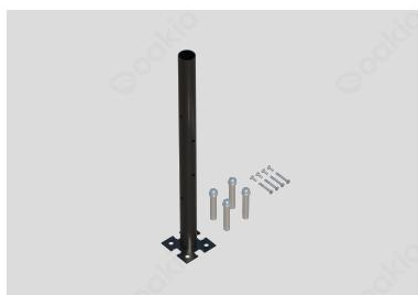
Steel Holder and accessories

* The following item is only necessary when choosing a 1.9m post