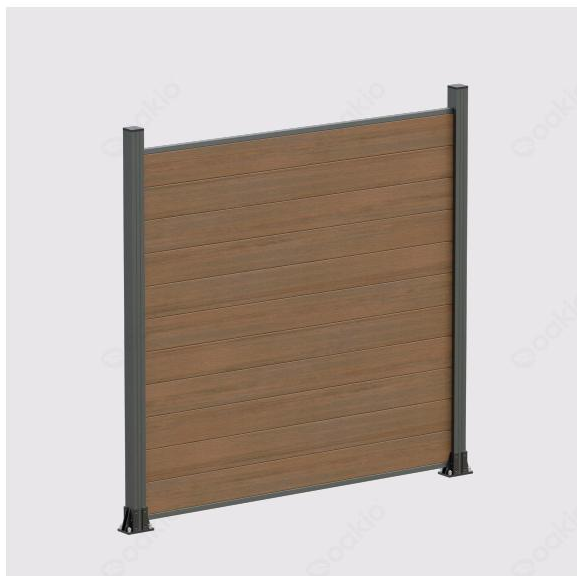
Proshield fencing with Aluminum post