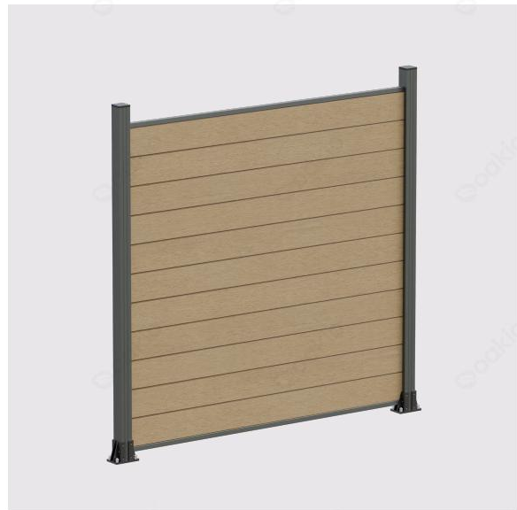
Iniwood fencing with aluminum post