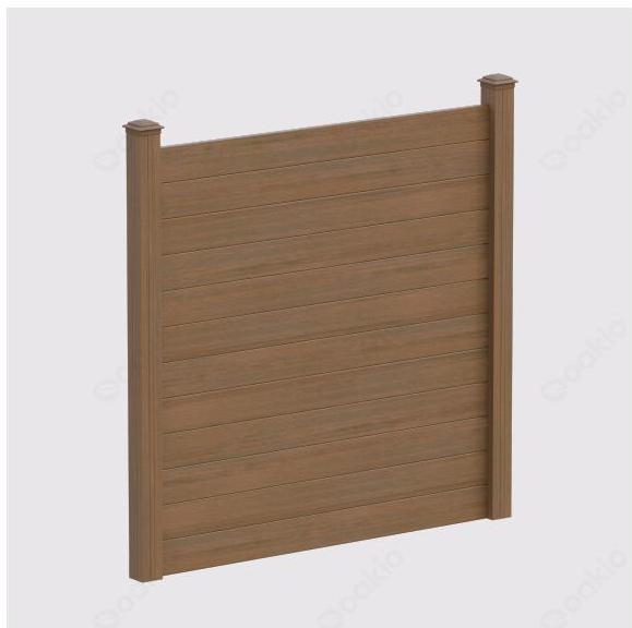
Proshield fencing with WPC post