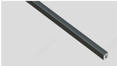
Aluminum Top Rail