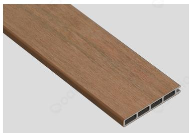
WPC Fence Top Board

Code: PFS-CS Dimension: 24 x 17.5 x 1905mm